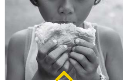
One nourishing meal for a hungry child: Just $2.20